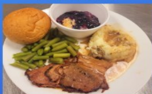
Garlic Rosemary Beef Roast