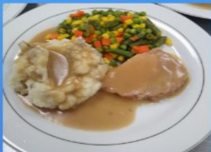
Pork Loin & Gravy