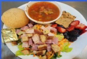
Chef's Salad & Garden Vegetable Soup