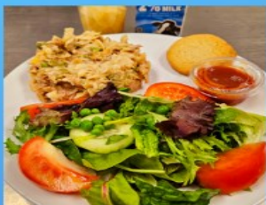
Tuna Noodles & Salad